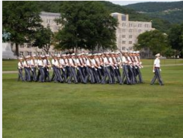
Acceptance Day Parade

head gear at all times when in public, our cadet was thankful that we brought him some comfortable clothes for the hotel room, which is considered a private place. We did learn that swimming in the hotel pool is off limits since that is considered a public place. A-Day also gives you the opportunity to bring everything your cadet would like for his/her barracks including a boodle box full of their favorite snacks and a blanket such as a Woobie poncho liner blanket. Our cadet appreciated most that we didn't forget his phone and charger.